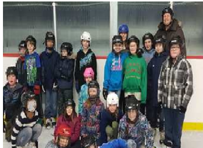
Grade Five Youth Arena Skating